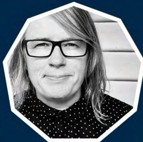
ANGELA BAILEY AUSTRALIAN QUEER ARCHIVES