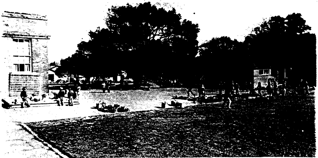
At play in the Infants' Department.