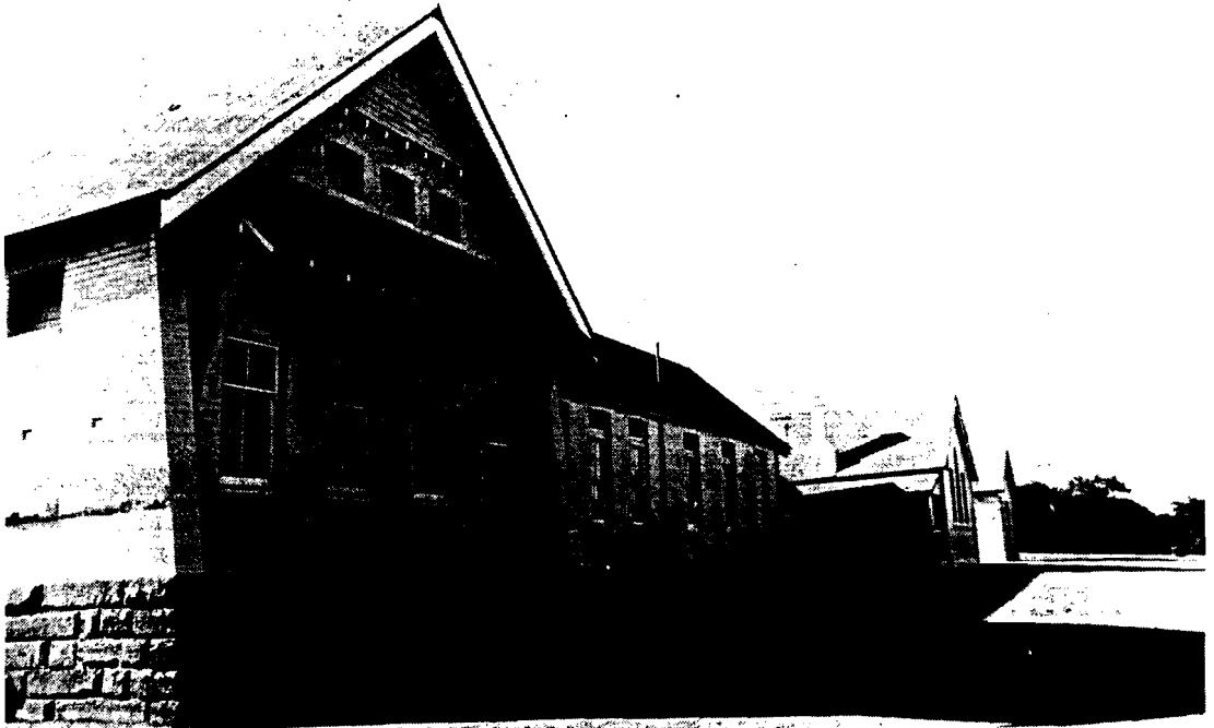
Original building with extensions.