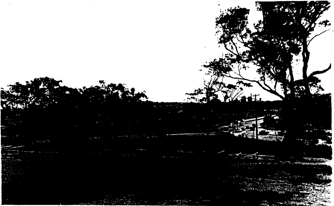
View over section of playground showing development of Personal Achievement Track.