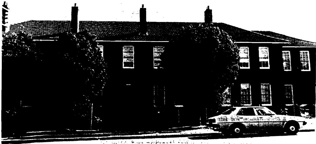
The Infants' Department built in 1937.